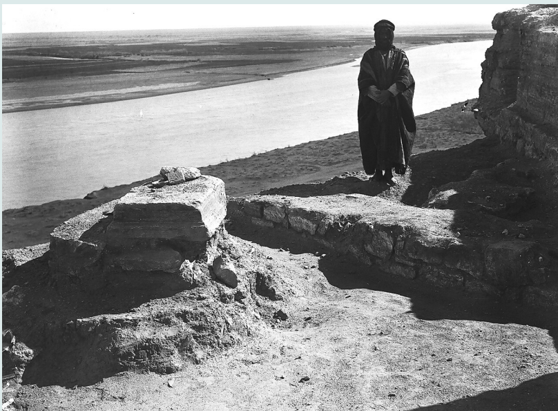
View of the Euphrates River from Dura-Europos